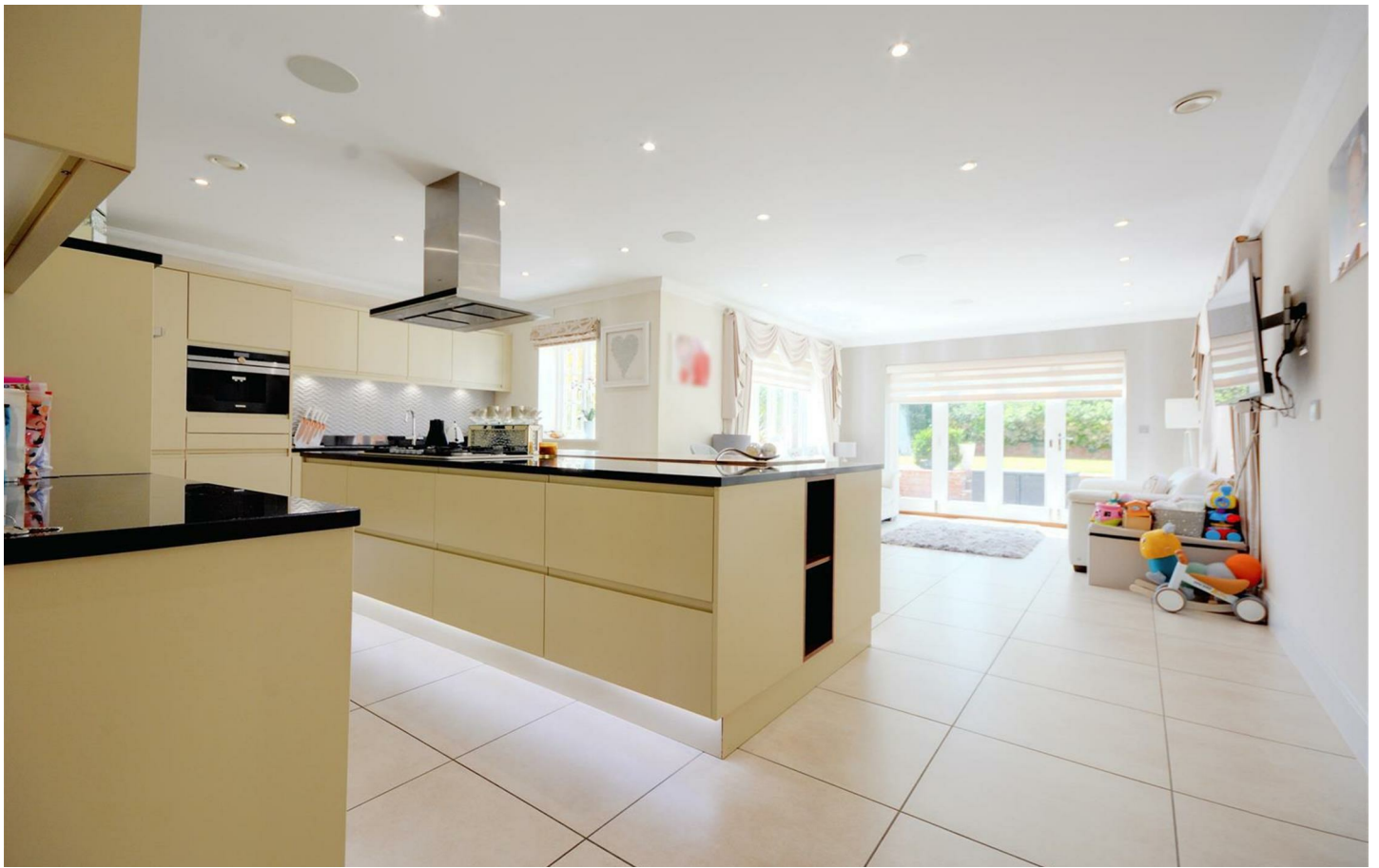
A Stunning Five Bedroom Detached House with a Stylish and Extensive Interior.

Tucked away down a small private road on a gated and generous plot sits this excellent detached house with a particularly impressive open plan kitchen/diner and living space to the rear, this rare opportunity will doubtless be a great appeal to a variety of potential purchasers.